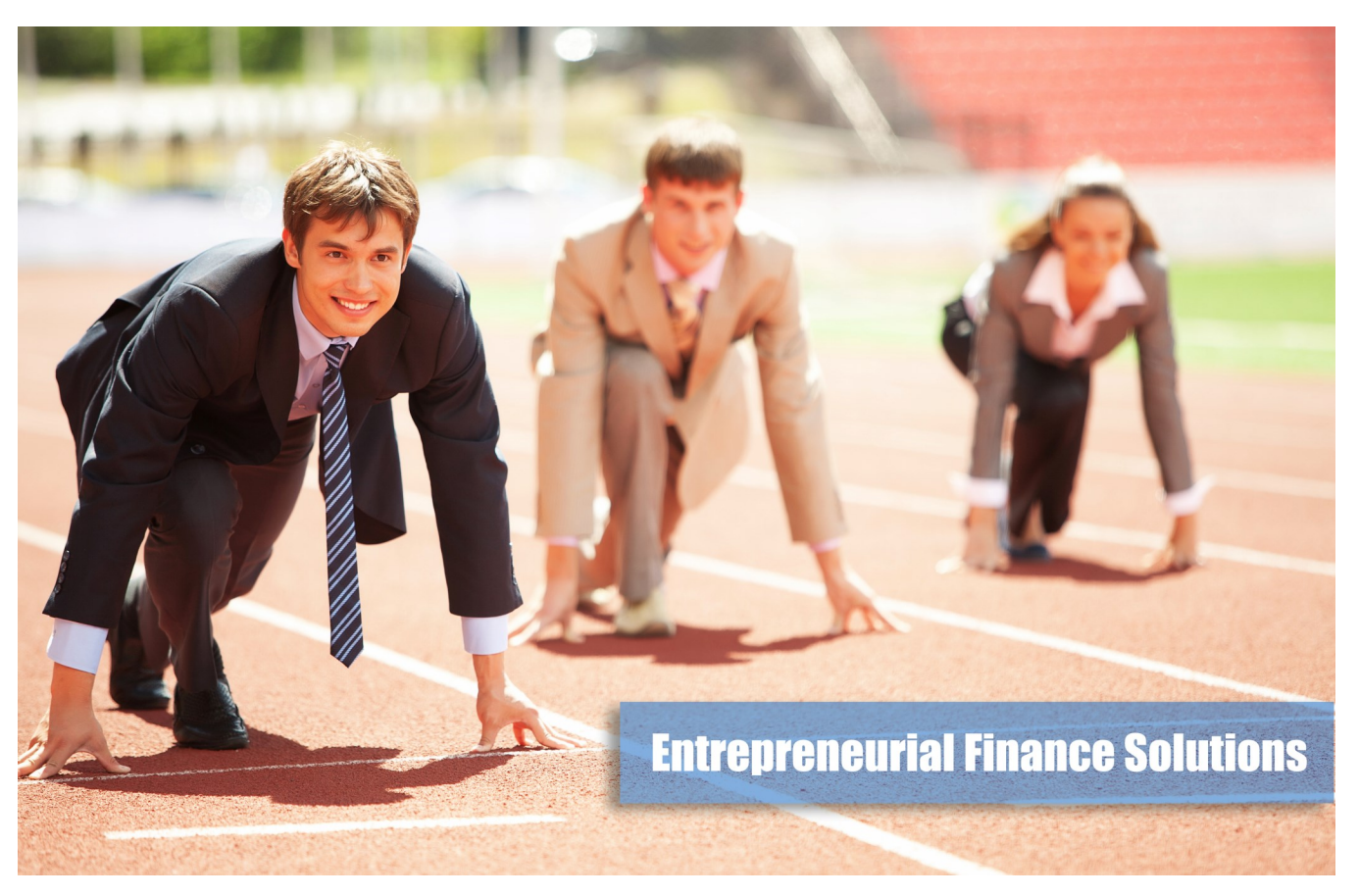
An Overview of Alternative Commercial Finance Solutions For Modern Day Small Business Entrepreneurs

There have been thousands of articles written about entrepreneurs and their unique characteristics. A common fallacy regarding entrepreneurs is that they are driven to build enormous entrepreneurial empires which is generally not the case. Most true entrepreneurs start their businesses simply to generate a "living" and a steady stream of income. They have had enough of being the "dependent" employee, wanting to achieve something greater and with more reward. They want to be their own person, make their own decisions, and run a business their way. And if you consider yourself to be an entrepreneur, you are in good company. It is currently estimated that there are roughly 582 million entrepreneurs in the world today.