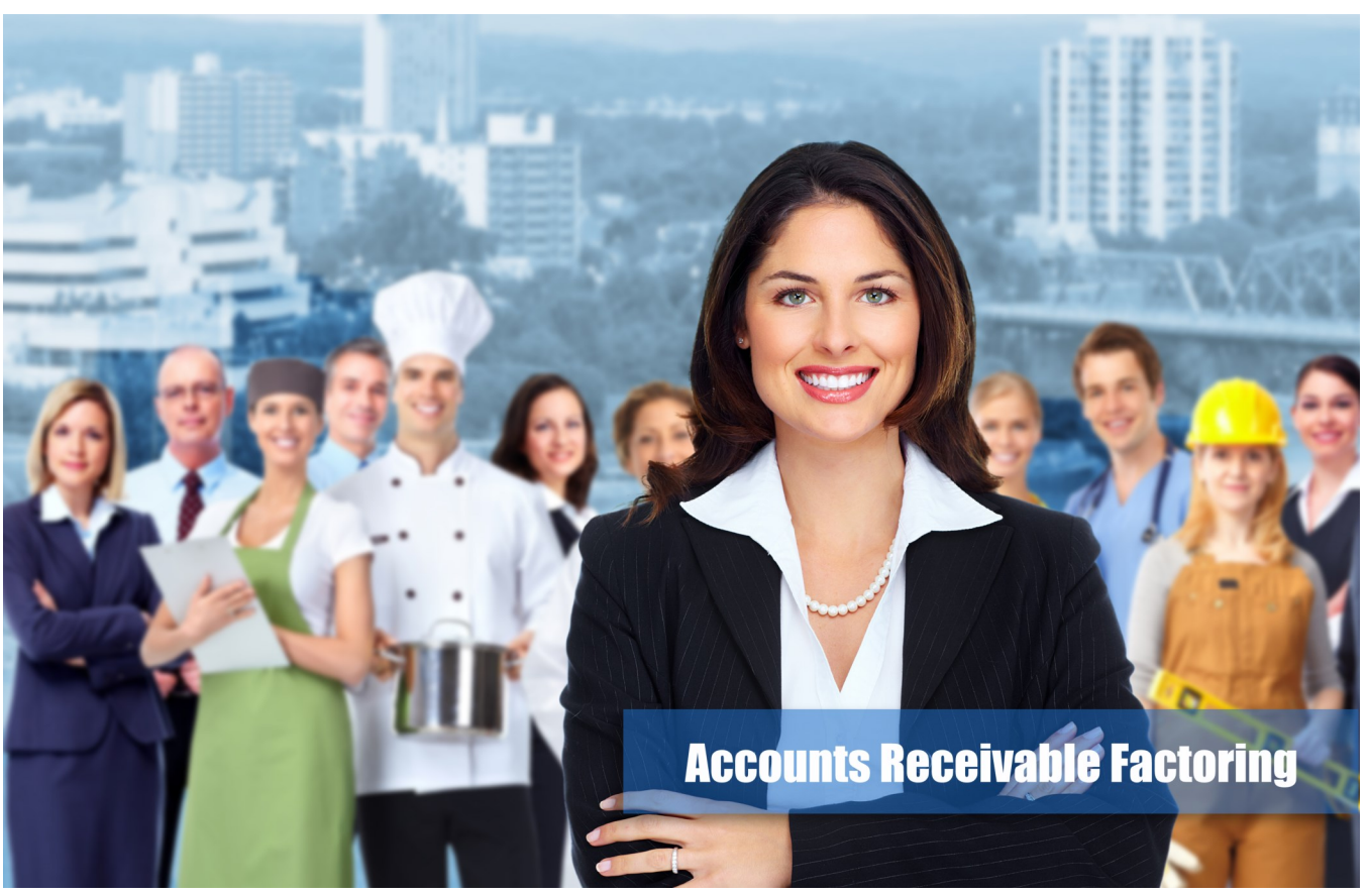
Accounts Receivable Factoring: How Factoring Can Help You Grow Your Small Business

In simple terms, factoring or accounts receivable factoring is the sale of the accounts receivable of a business at a discount to a finance company known as a factor . Factoring is commonly employed by, and directly addresses the cash flow problems of, businesses that grant extended terms of payment to their customers for goods or services purchased, allowing those customers to delay payment upon invoices for 30, 45, 60 days or longer. Factoring is probably the oldest form of commercial finance known to man and is utilized as a business finance strategy in almost every corner of the globe.